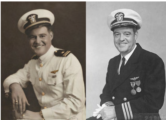
Lamar Binion as a LTJG in 1941 and as a CDR circa 1959

VP-45(PBY), a sister squadron, of sorts, to VP-205 (which later became the current VP-45) had four commanding officers during its short life during WW-II. Although this PBY squadron was established as VP-45 in March of '43, it was redesignated VPB-45 (Patrol Bombing Squadron) about 18 months later.