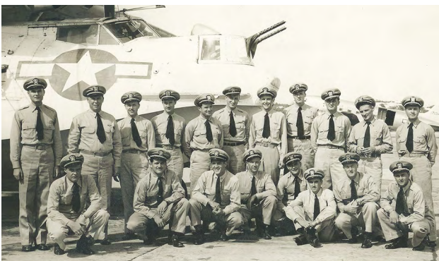
Squadron Officers in front of PBY aircraft