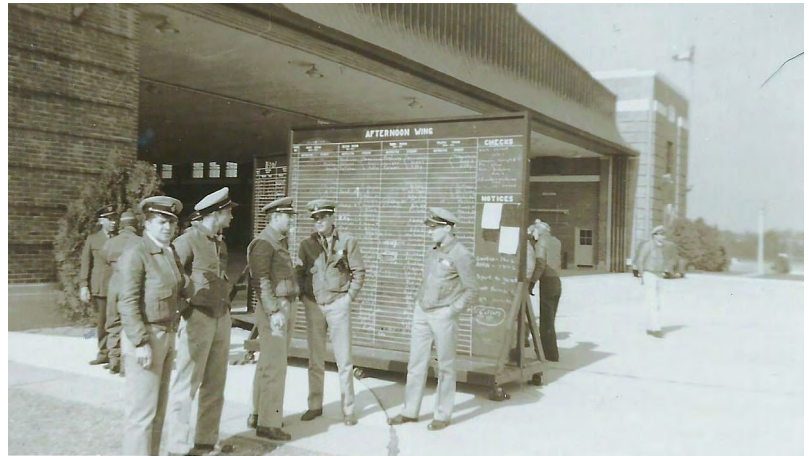
Above: student pilots check the flight schedule blackboard circa 1939 in Pensacola.