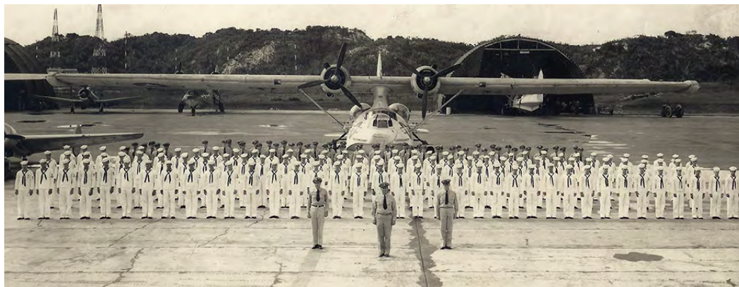
VP-45(PBY) in squadron formation, May 1945 in Brazil