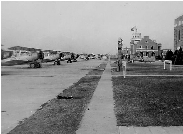
Training Flight Line - Pensacola circa 1940