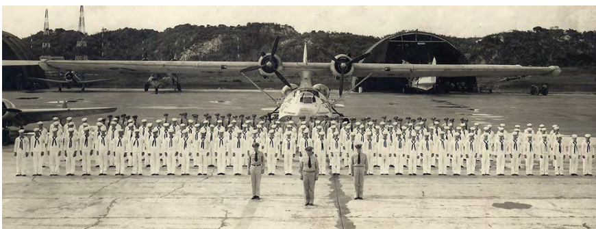
LCDR Binion (front row left) with VP-45 in squadron formation

Monday, September 27, 1943—The Atlanta Constitution—13