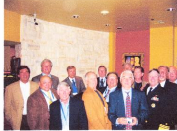
2006 San Antonio