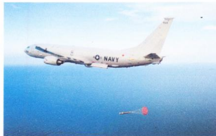
First MK54 Lightweight Torpedo Dropped from a P-8A