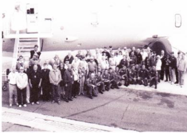
2010 Alexandria/Pax River