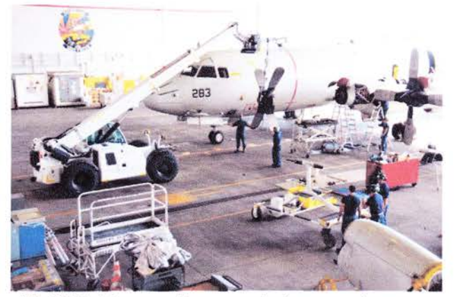
VP-45 Maintenance Team conducts a prop change on the #2 engine