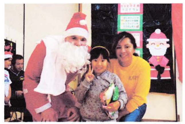
VP-45 Sailors participate in Christmas event at a local Okinawa Elementary School

While sustaining these many detachments and at some times, 24 hour flight operations, our Sailors have also been able to experience the local Okinawan culture as well as support local schools and orphanages. The squadron also won the Kadena Captain's Cup for both volleyball and football. The bowling teams currently occupy 1<sup>st</sup> and 2<sup>nd</sup> place and basketball season is just around the corner!