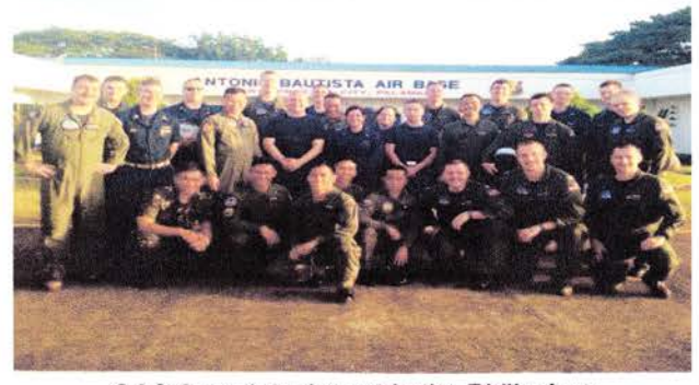
CAC-8 on detachment in the Philippines

We've also completed a detachment to Utaphao, Thailand in support of Exercise Cobra Gold. Additionally, we sent two combat crews and support personnel to Pierce, Australia in support of Exercise TAMEX.