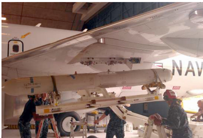
Squadron Harpoon Loadout, August 2013

The U.S. Navy has extended its contract with Boeing for P-8A Poseidon aircraft. It ordered 13 more of the planes, which are based on a 737 airframe and are used for anti-submarine, anti-surface and surveillance missions, for $1.98 billion. The deal is the extension of an existing contract that is ultimately planned to include 100 Poseidon aircraft. On 24 June, a P-8A Poseidon from Air Test and Evaluation Squadron (VX) 20 successfully fired a Harpoon AGM-84D Block 1C missile and scored a direct hit on a Low Cost Modular Target (LCMT) at Point Mugu's Sea Test Range. In preparation for the first deployment of a P-8A squadron to the Western Pacific in December 2013, VP-16 began training with the Harpoon at Patuxent River, MD in August 2013. They will be conducting multiple detachments over the next few months to exercise the entire P-8A support system.