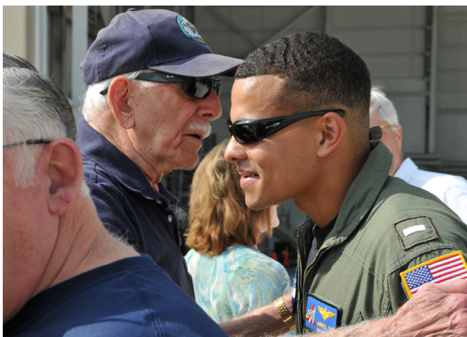
A young Pelican aviator receives needed guidance from a distinguished Association member