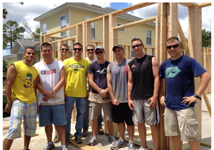
Pelican Habitat for Humanity Team at Build Site

Three weeks have now passed since the Pelicans began training in their new aircraft. Everyone has hit the ground running, including the VP-45 maintenance professionals who have already begun working side-by-side with P-8A maintenance personnel at the Maritime Patrol and Reconnaissance Fleet Replacement Squadron, VP-30. Although the P-8A syllabus will be a demanding curriculum to complete over the coming six month transition period, the Pelicans have already demonstrated that they are up to the task of leading the squadron through its fourth aircraft transition since 1942.