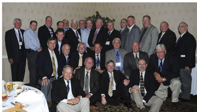
1970's Group at 2012 Reunion in Mobile