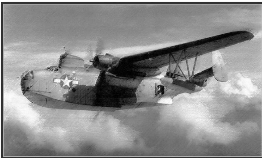
VP-205 PBM enroute Onstation circa March 1943