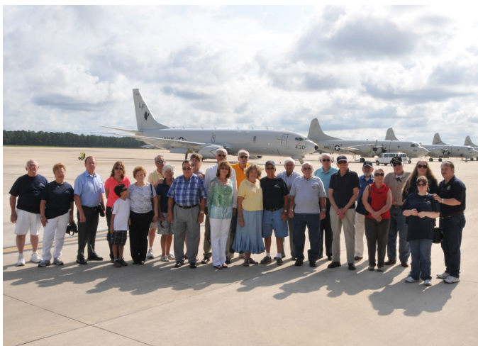
25 of the 35 Association Member Attendees in front of the P-8