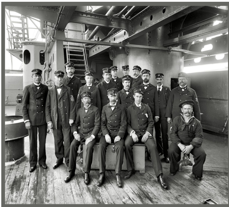
Chief Petty Officers aboard USS Texas circa 1899

and, as their skills increased, they became more identified with the management communities. A sailor was becoming more than just a body to handle lines or scramble around rigging. He was entering an age where a good level of education was needed to function in an increasingly complex Navy. Thus, as he was becoming a technician in both mechanical and logistical areas, a revision of uniform regulations in 1874 further modified